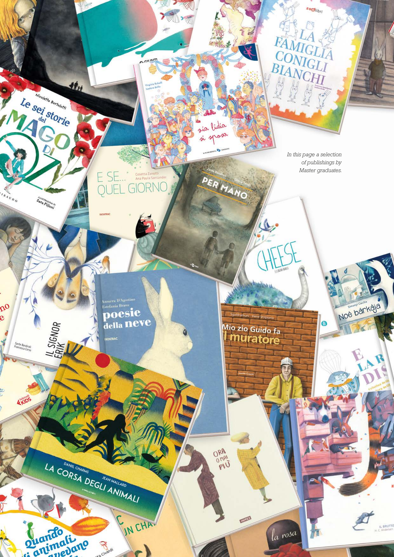
In this page a selection of publishings by Master graduates.