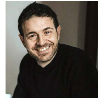
Simone Rea (illustrator)