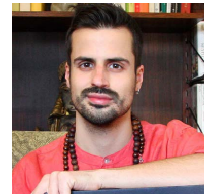
Michelangelo Rossato (illustrator)